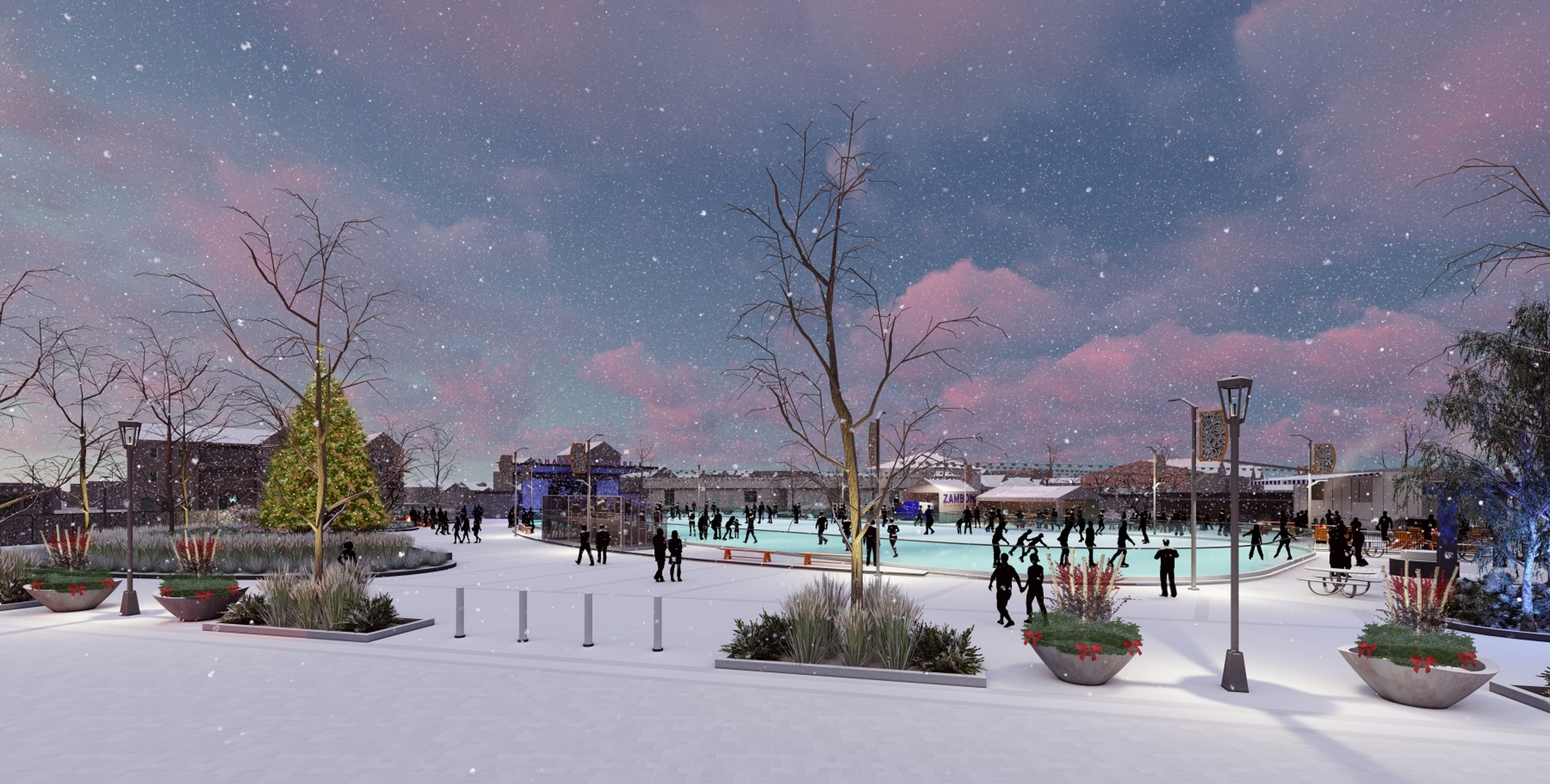
HARMONY SQUARE VIEW 4 | WINTER CONCEPTUAL ILLUSTRATION