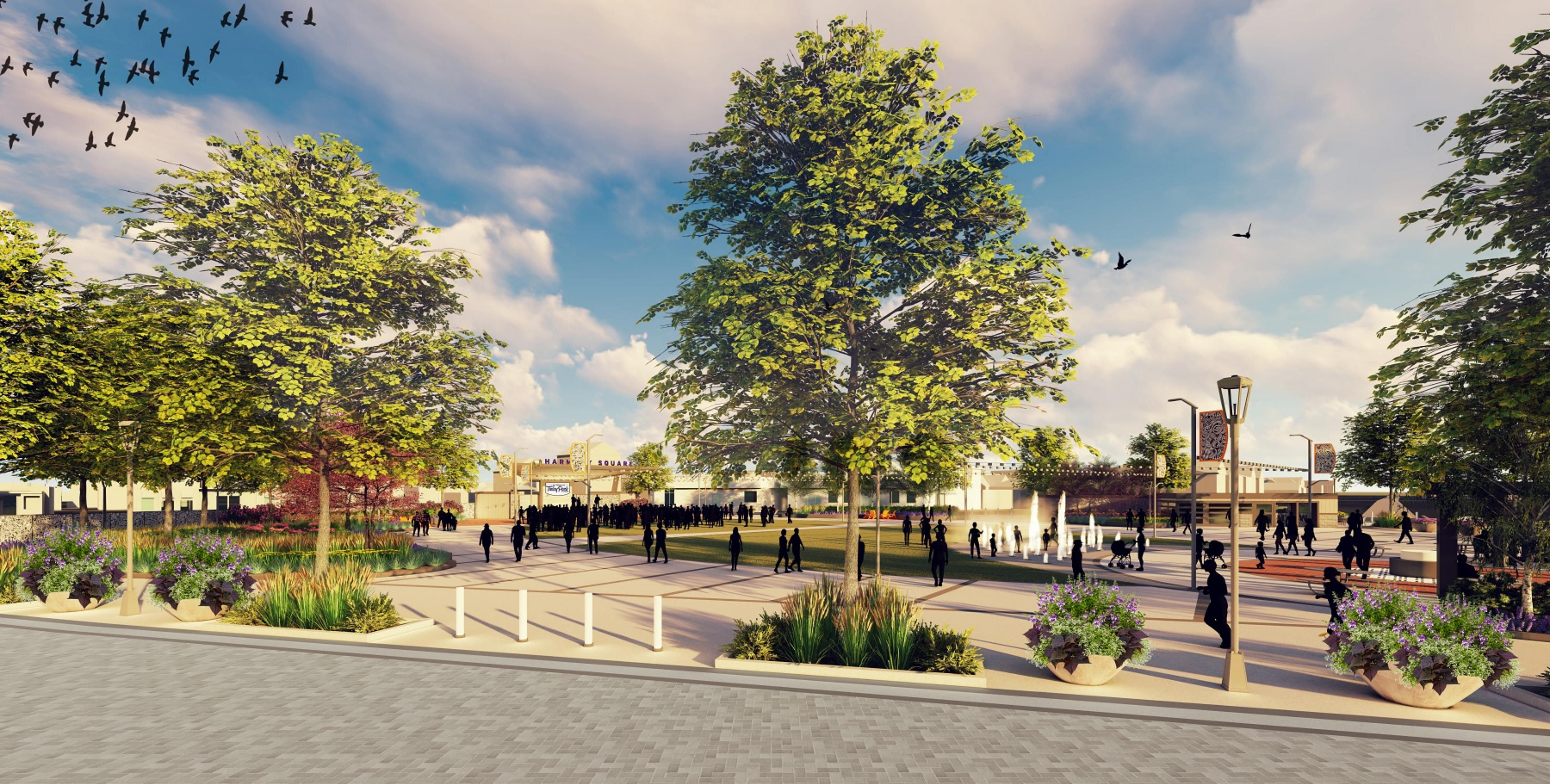
HARMONY SQUARE VIEW 4 | SUMMER CONCEPTUAL ILLUSTRATION