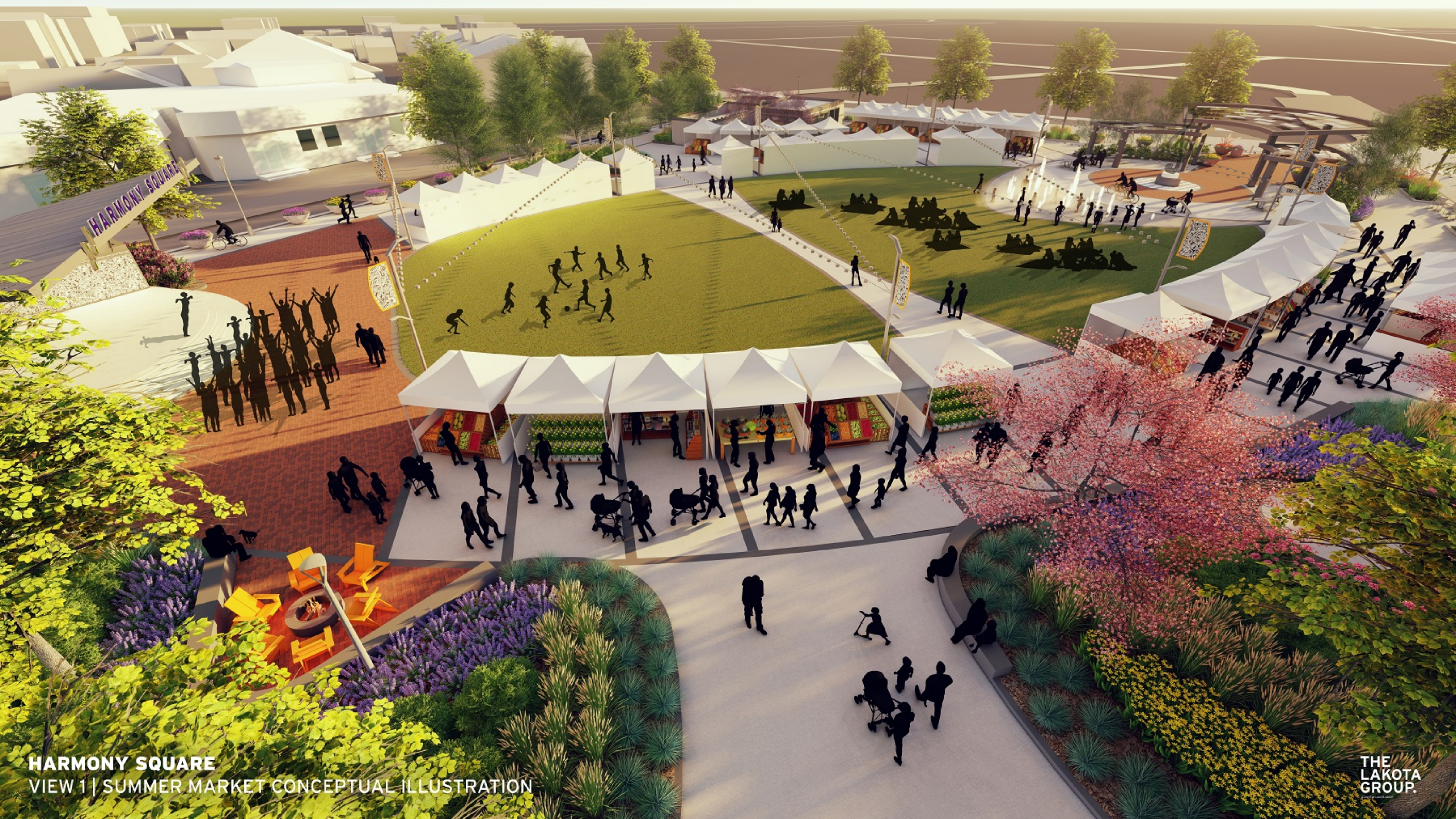
HARMONY SQUARE VIEW 1 | SUMMER MARKET CONCEPTUAL ILLUSTRATION