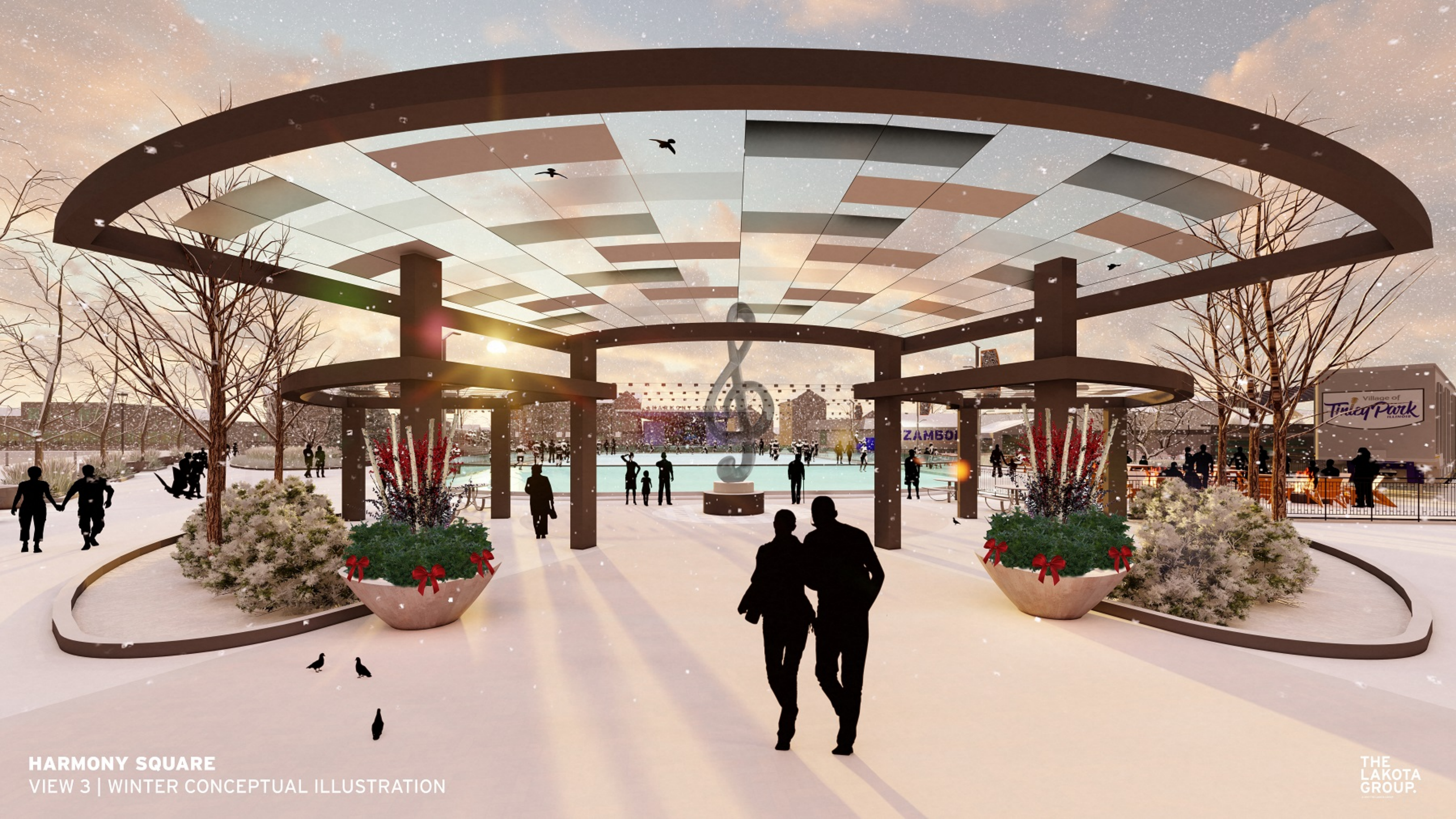
HARMONY SQUARE VIEW 3 | WINTER CONCEPTUAL ILLUSTRATION