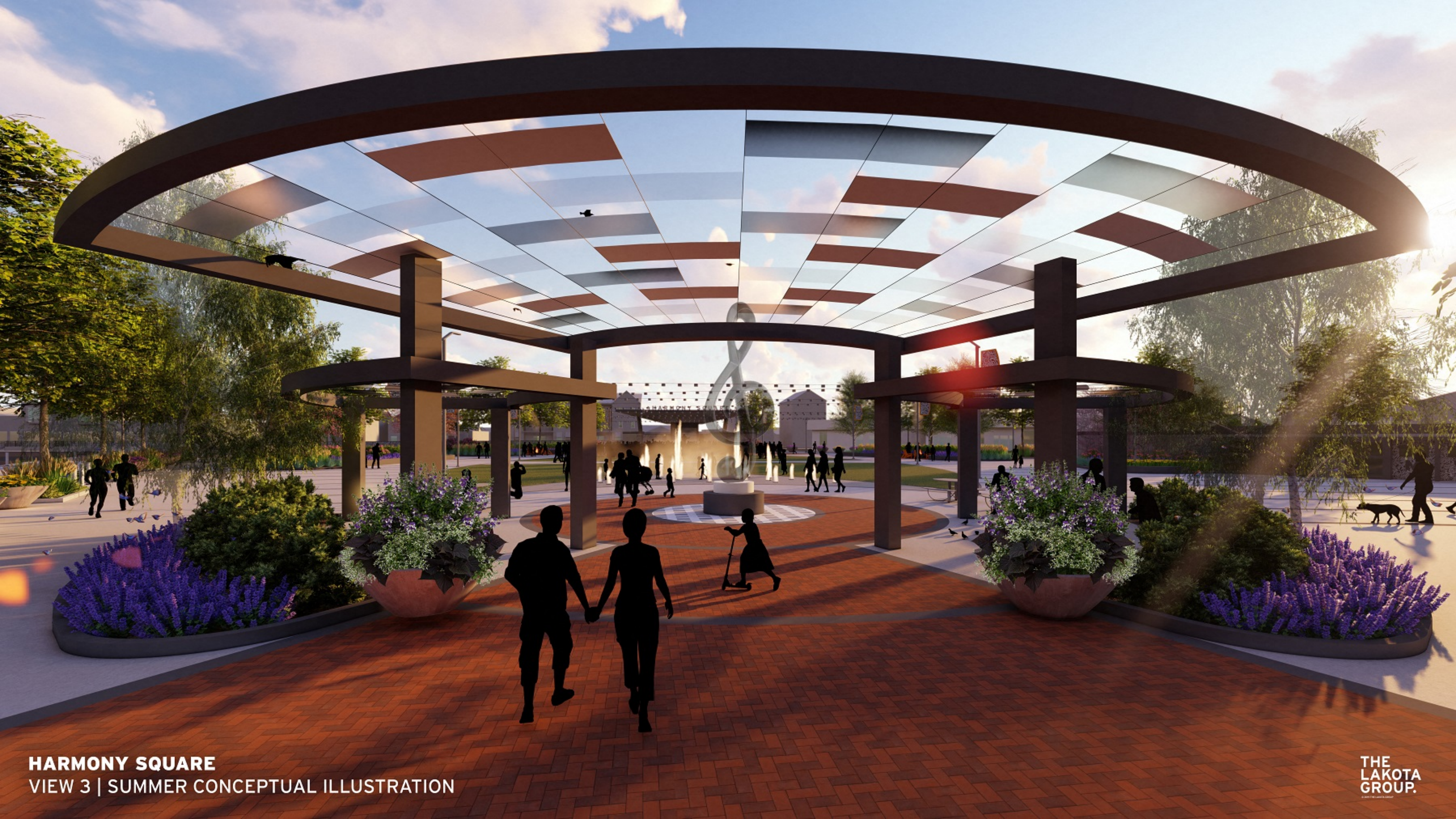
HARMONY SQUARE VIEW 3 | SUMMER CONCEPTUAL ILLUSTRATION