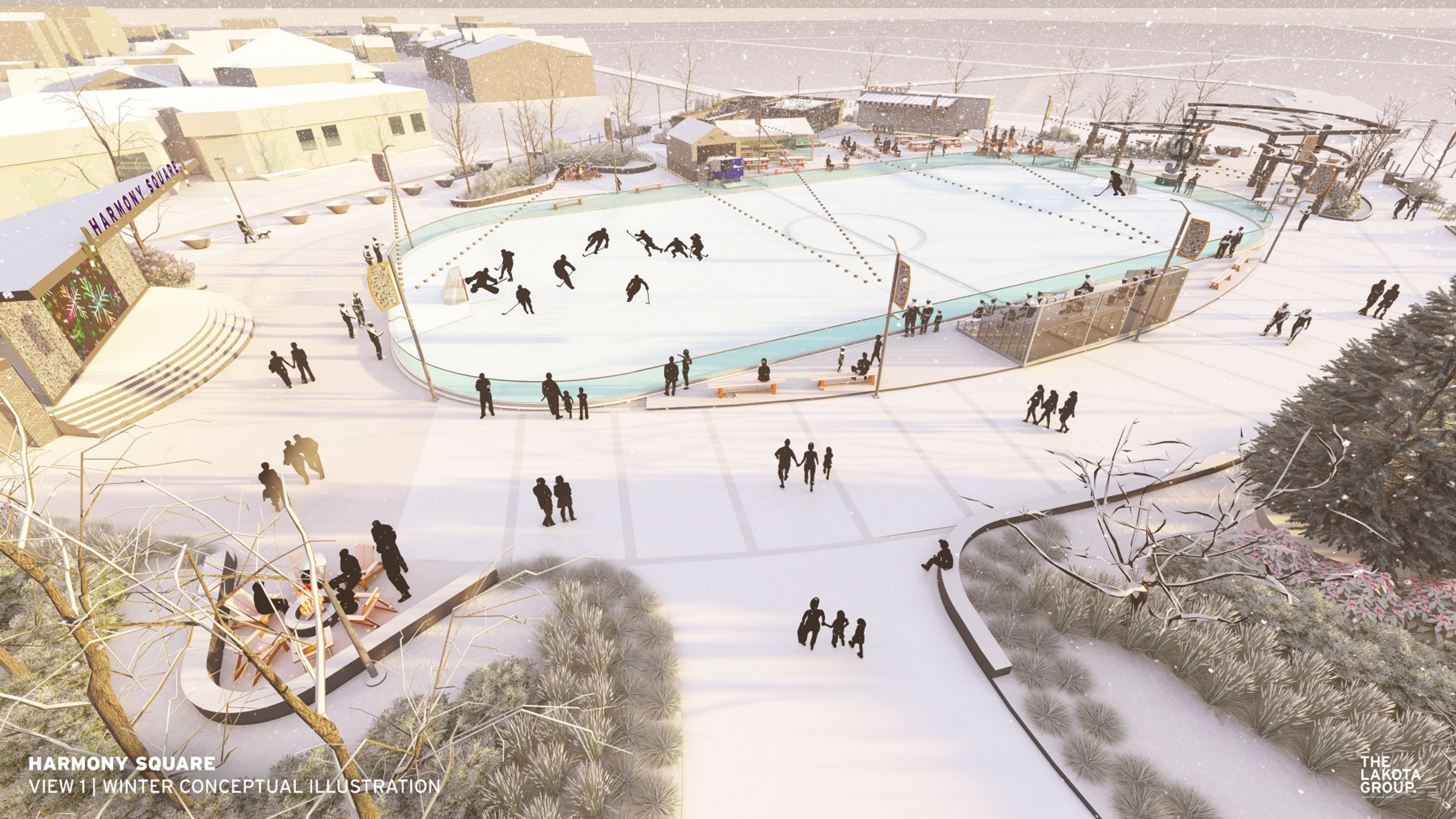
HARMONY SQUARE VIEW 1 | WINTER CONCEPTUAL ILLUSTRATION