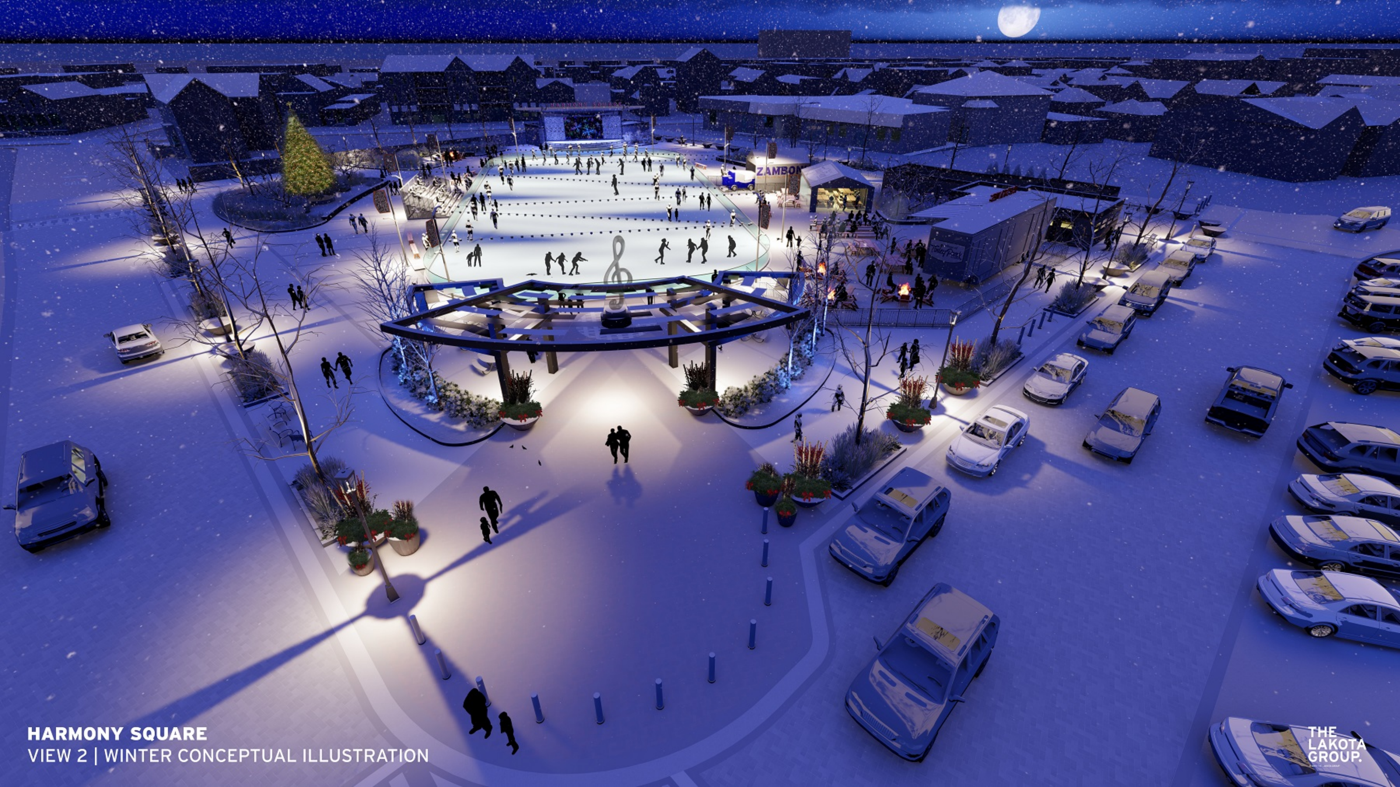
HARMONY SQUARE VIEW 2 | WINTER CONCEPTUAL ILLUSTRATION